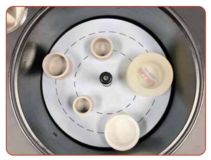
Large 10" (254 mm) diameter chamber (turntable version shown with guide marks for mounting cups)