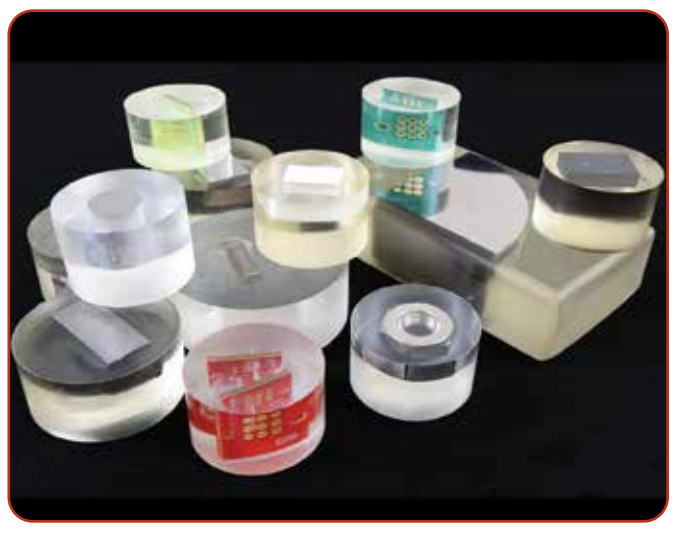
Accommodates all mount shapes & sizes