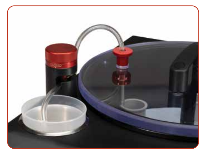
Through-port for optional epoxy fill under vacuum