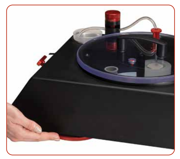
Turntable version allows continuous fill of mounting cups under vacuum