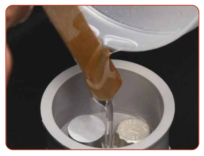
Easy access to directly pour epoxy into mounting cups