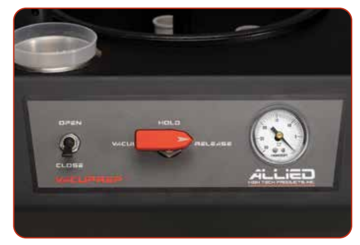
Simple, quiet compressed air operation