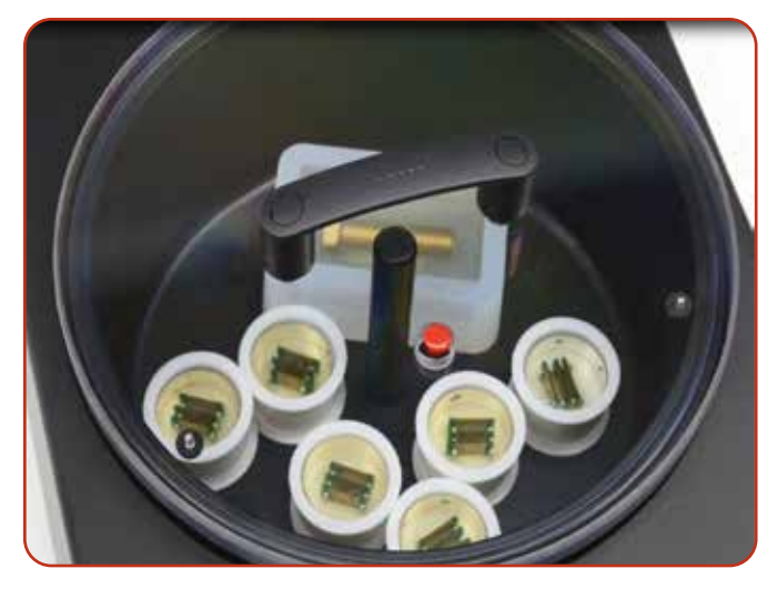
Clear top to allow sample viewing during process